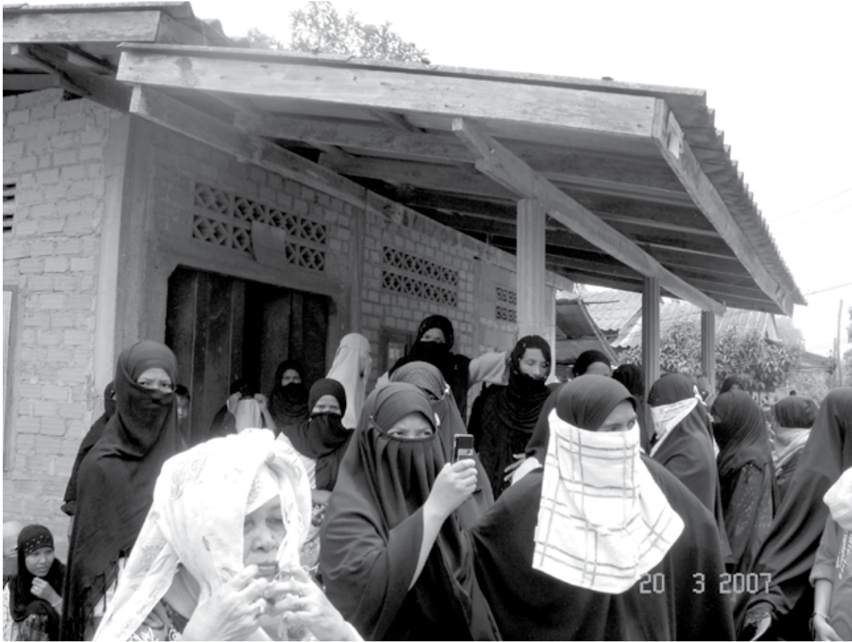
The demonstration at the Isla Huddin Pondok School, Sabayoy district, Songkhla, after two students were shot dead by armed forces believed by the villagers to be state officials on 19 March 2007