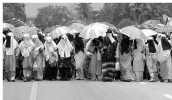
Malay Muslim women blocking the road

them very young children, and when being held in the military barracks, they have to bring their children along. 13 Reportedly, some women were subject to detention since they appeared to be owners of the vehicles used by their husbands to commit the violence, though they are unable to drive. In some instances, they were rounded up while being forced by the insurgents to tend to the wounded persons after clashes with the state officials. 14